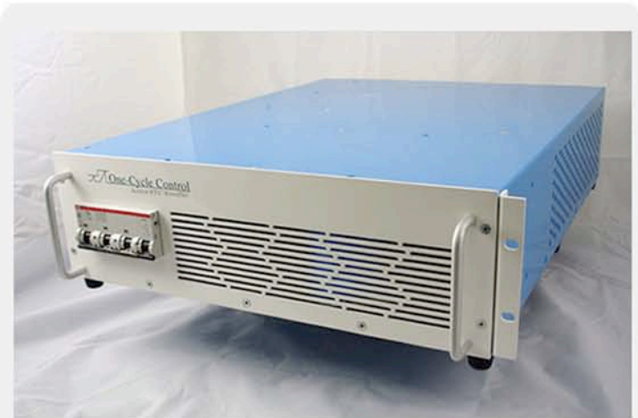
40 kW OCC Active PFC Rectifier

12x Size Reduction! 7x Weight Reduction! Less raw material!